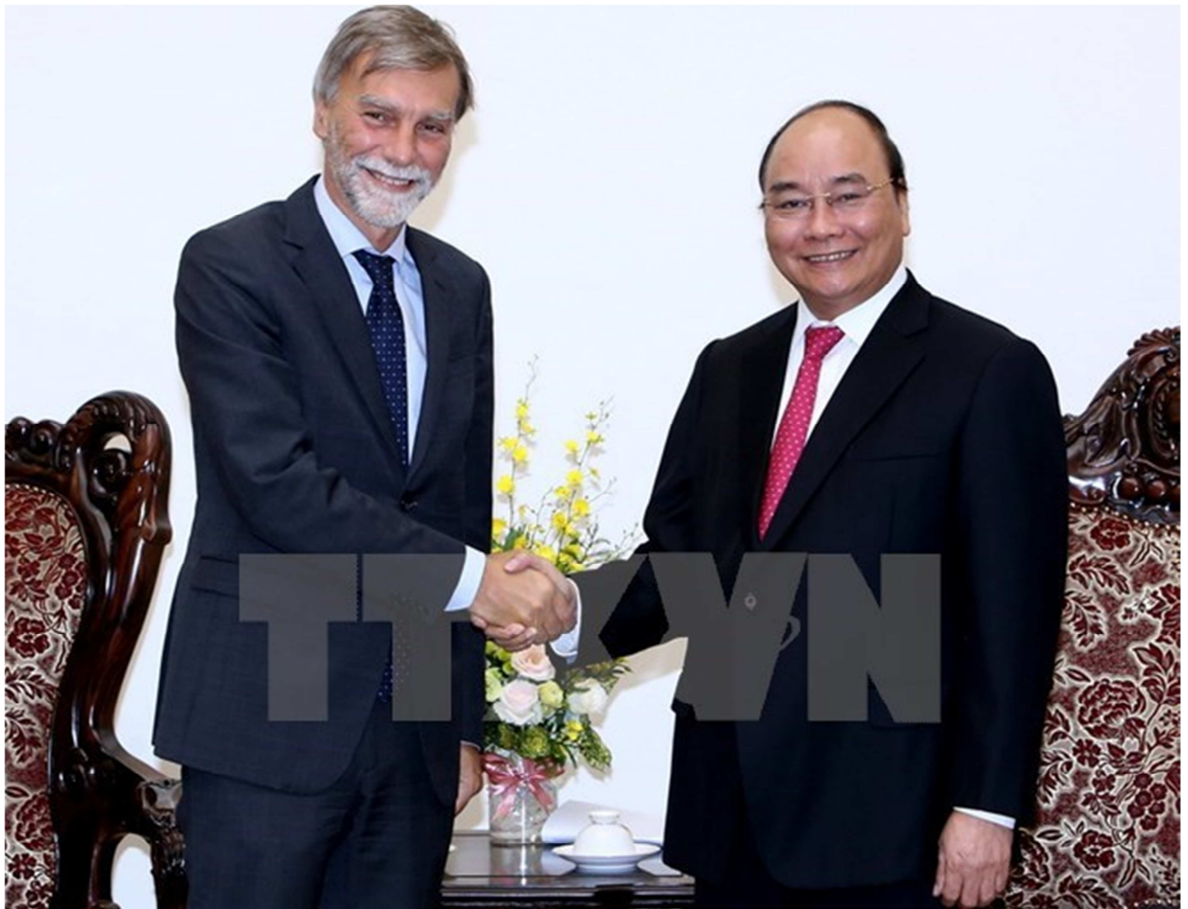
Prime Minister Nguyen Xuan Phuc (R) and Italy's Minister of Infrastructure and Transport Graziano Delrio

Prime Minister Nguyen Xuan Phuc met on September 26 with Italy's Minister of Infrastructure and Transport Graziano Delrio, who said his country will be a companion to Vietnam during the course of development.